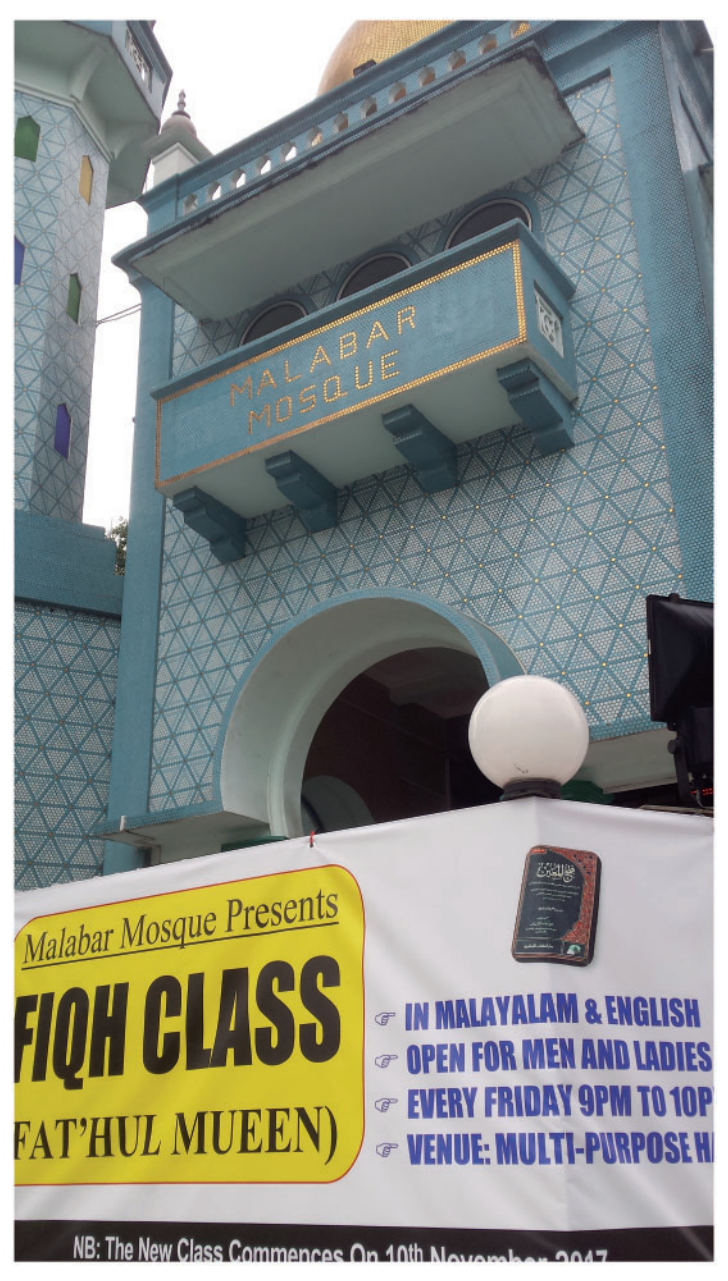
Figure 2. An advertisement in front of a mosque in Singapore of an Islamic law course offered to the public through learning the Fath : at the mosque.

texts with strong arguments against their male-chauvinistic elements and misogynistic statements.<sup>39</sup> In Banda Aceh, they even study and teach the Tuḥfa and their